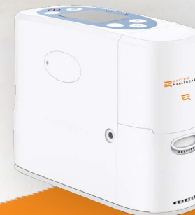
P2-E6 PORTABLE OXYGEN CONCENTRATOR